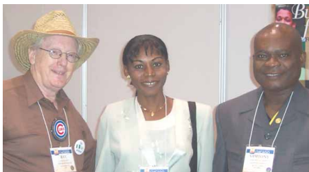
Ray welcomes the first Africans to sign up

seen by more than 1-billion TV and Internet viewers? With mega-super stars like Bono, Paul McCartney, Madonna, and 160 bands and artists performing at eight concerts in Tokyo, Moscow, Berlin, Paris, Johannesburg, Philadelphia, London, and Toronto, with non-stop live coverage by MTV and re-broadcasts by ABC, we can assume that Planet Earth knows the need in Africa. The G-8 Summit meeting in