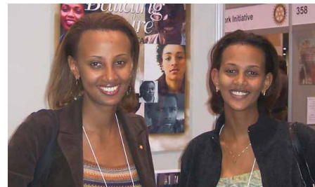
Sisters from Ethiopia, eager to take Youth IT home

water, food, and can gain a better way of life that is satisfying and peaceful. There are many well-educated Africans with access to water, food and health care — but they still can not find jobs! So they migrate to Europe and America — we now have 1-million African immigrants in the US! And they brought their education and skills with them, all desperately needed