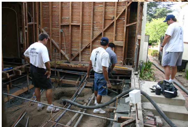
20 yards of concrete gets pumped into the footings while 3 supervisors "super-vise"