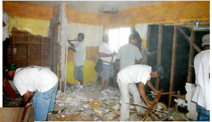
The Demolition begins

Sparks - Altadena Rotary Club Newsletter