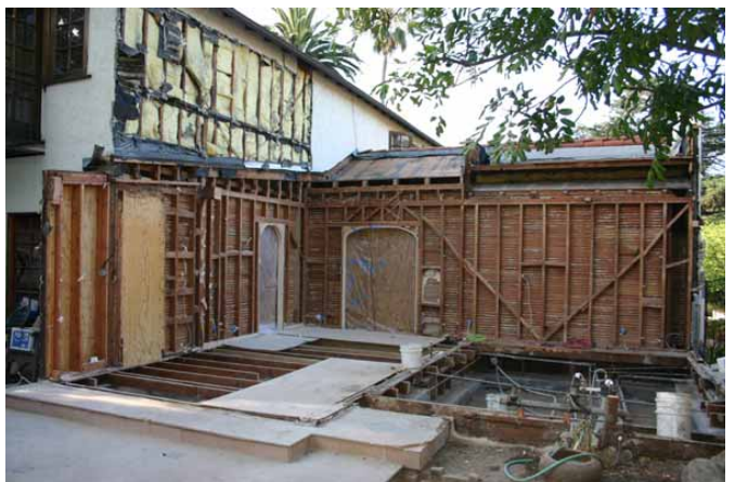
Demo and footings complete. Ready for framing